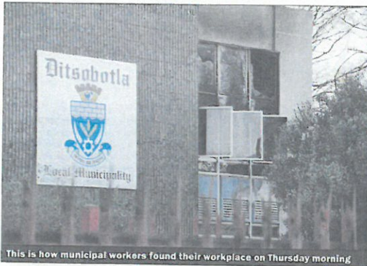
This is how municipal workers found their workplace on Thursday morning.