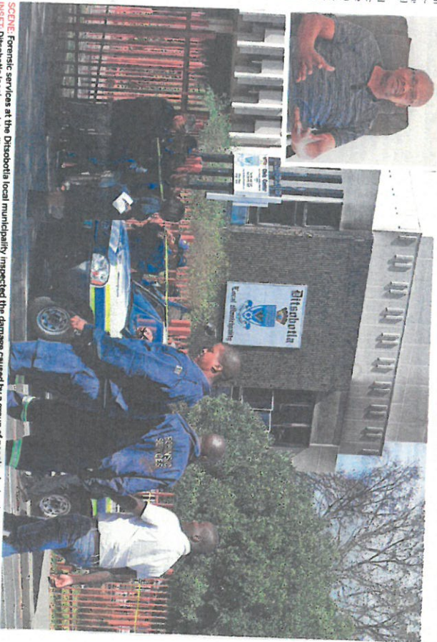
SCENE Forensic services at the Ditsobotla local municipality inspected the damage caused by a group of people who torched the building. INSERT Ditsobotla local municipality mayor Daniel Buthezi briefed the media about his hostage drama. FILE PHOTO